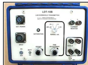
LDT-10B Laboratory Transmitter