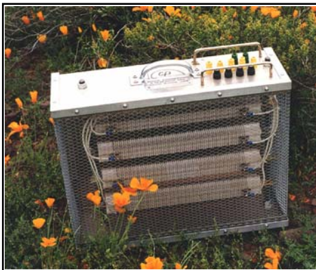
LB2500 Load Bank