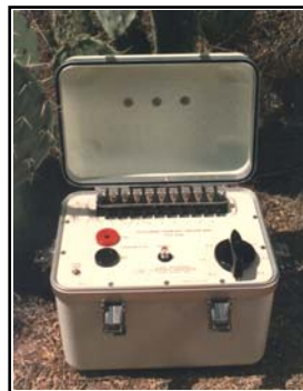
ETS-9/20/40 Switch Box