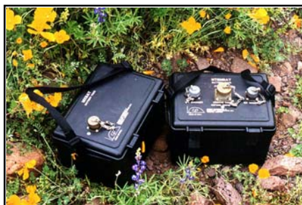
MXBAT & NTEMBAT Batteries